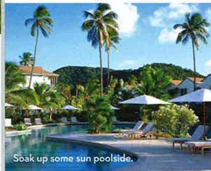
Soak up some sun poolside.

For some fun in the sun, minus the crowds, Antigua is the perfect honeymoon hideaway. A tiny island in the West Indies , Antigua offers plenty of privacy and lots of beaches—365 in total! When it comes to the sweetest sleep on the island, the luxe Carlisle Bay is it. This Leading Hotels of the World property is located in southern Antigua and has just 88 rooms ranging from oceanside suites (request one of the honeymoon suites, which comes with your own personal butler) to beachfront grand villas that overlook the sparkling Caribbean Sea . There is much to explore at Carlisle Bay, especially if you love the water: Hobie Cat sailing, windsurfing, boat excursions and snorkelling trips to nearby reefs are high on the resort's must-do activity list. One of the most breathtaking sights at the resort is the sunrise—be sure to take a morning hike through the adjacent rainforest for an experience that's simply magical. —Roseanne Dela Rosa